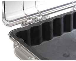
1061 Replacement Case Liner