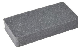
1062 Pick N Pluck™ Foam Insert